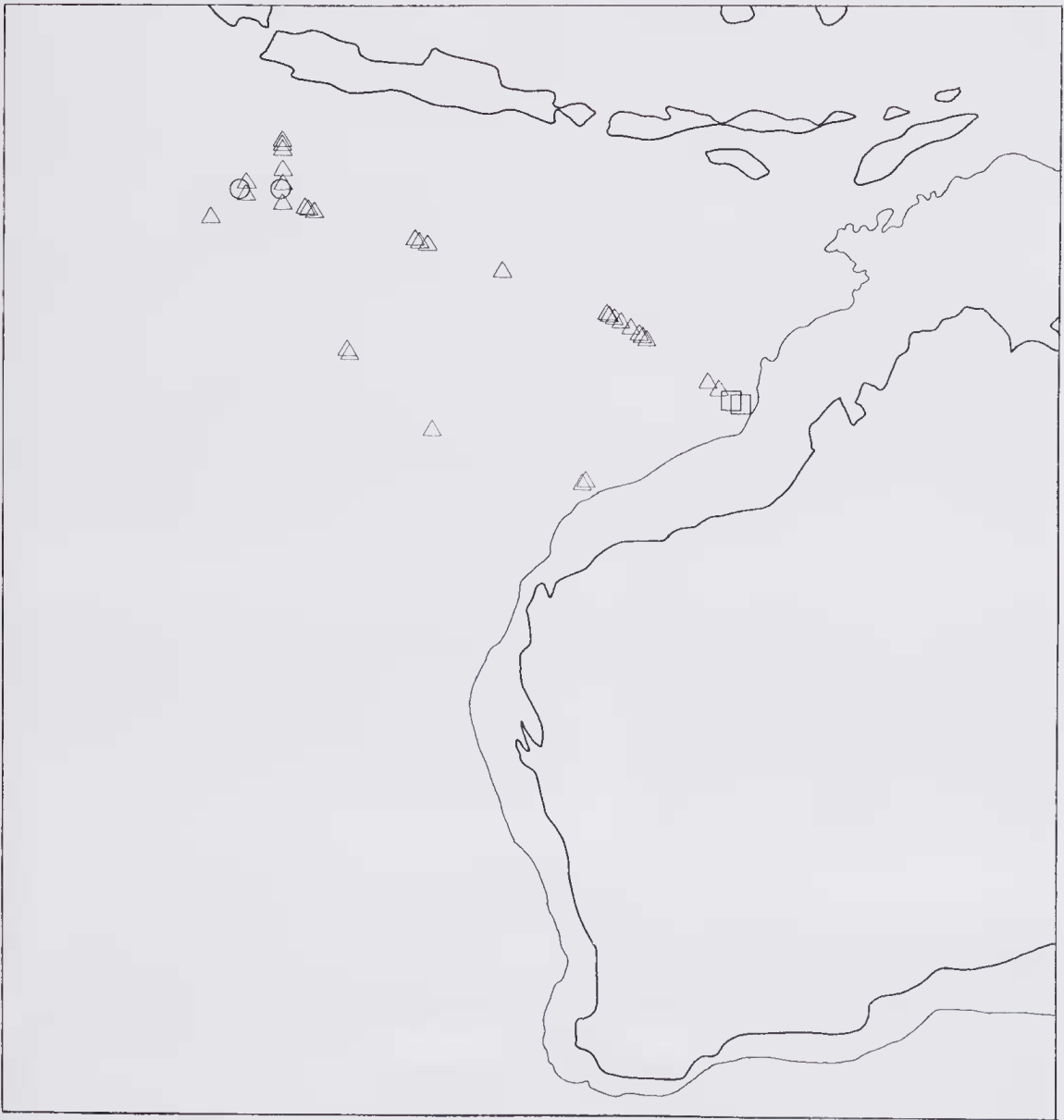
Figure 4 The localities at which the Gadfly Petrels Bulweria bulwerii , Pterodroma barau and Pterodroma rostrata were recorded. Each symbol indicates an independent sighting involving one or a number of individuals.